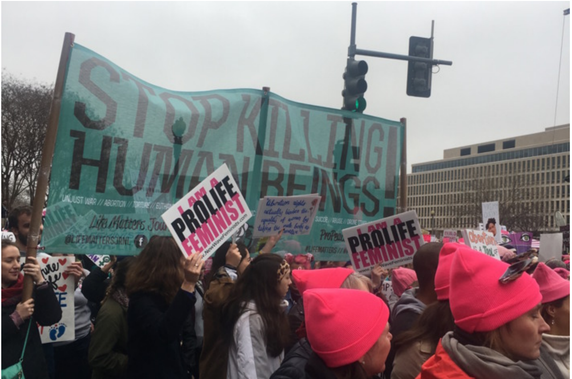
Anti-choice marchers.