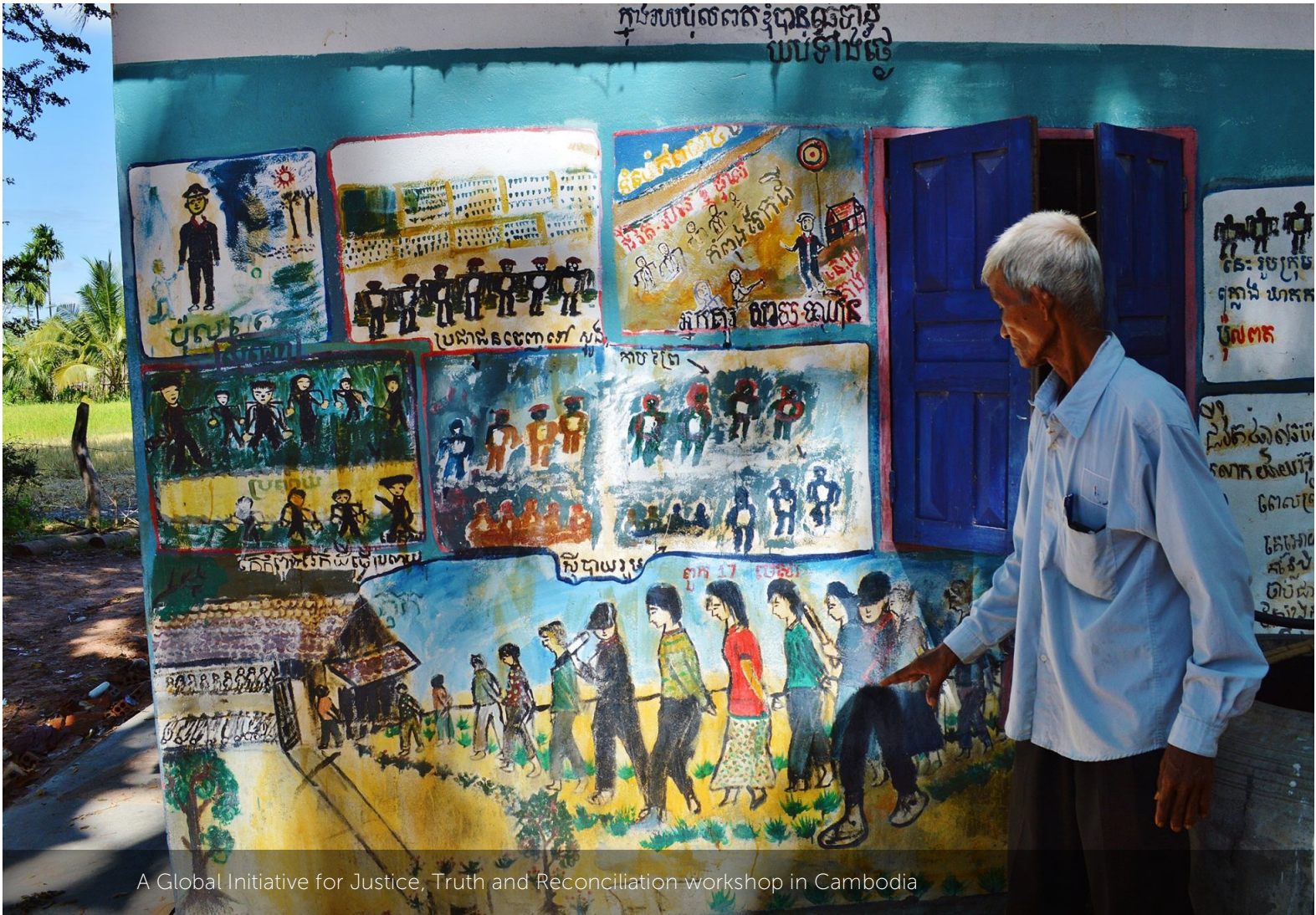
A Global Initiative for Justice, Truth and Reconciliation workshop in Cambodia

Foster the development of new Sites of Conscience programs, continuing to respond to emerging global and regional challenges and urgent needs.