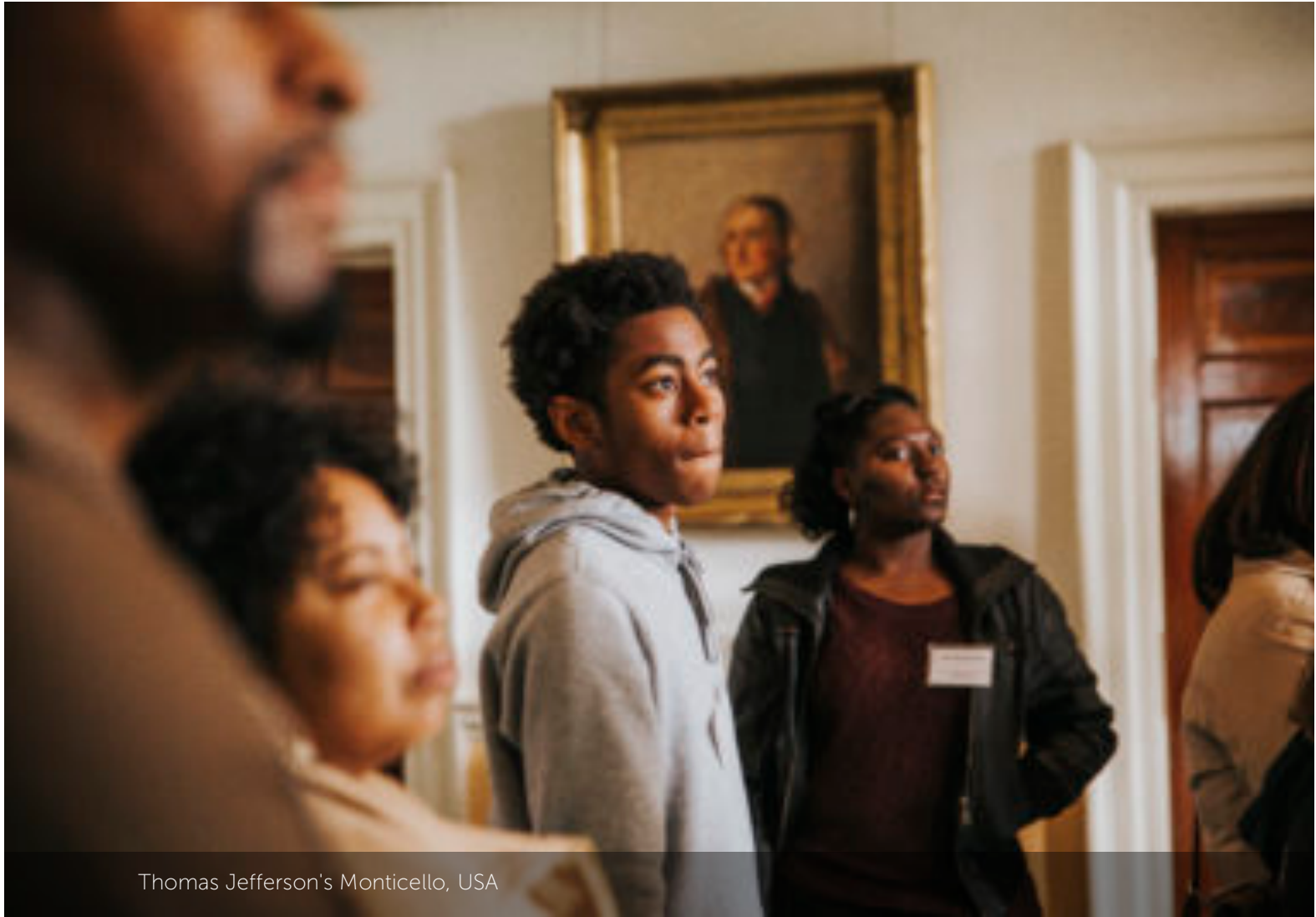
Thomas Jefferson's Monticello, USA

Deepen the concept and practice of existing members of the Sites of Conscience network.