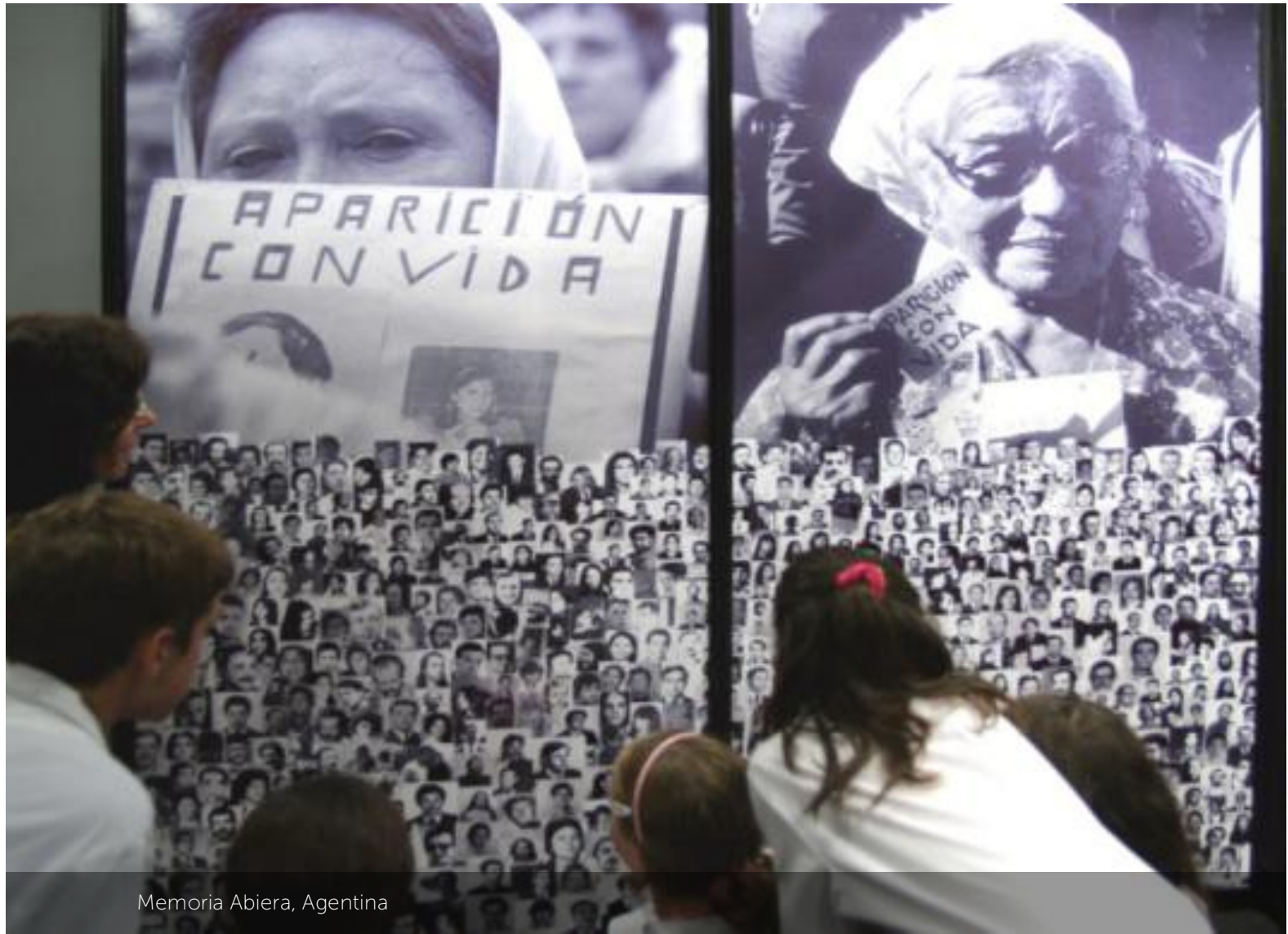
Memoria Abiera, Argentina

Deepen and widen the Sites of Conscience movement, combining the strengths of memory, truth-telling, heritage, arts and culture, as an instrument to build ethical cultures embracing human rights, peace and democracy.