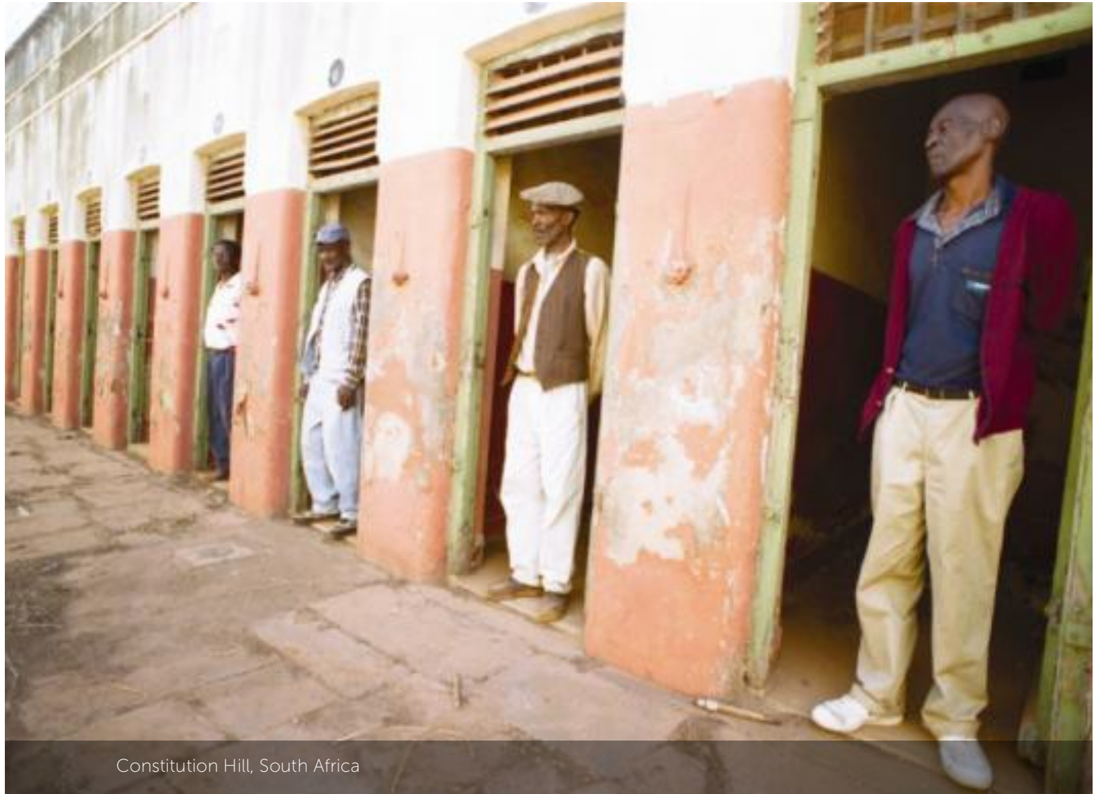
Constitution Hill, South Africa

Develop an organizational infrastructure optimal for meeting the Coalition's mission and goals.