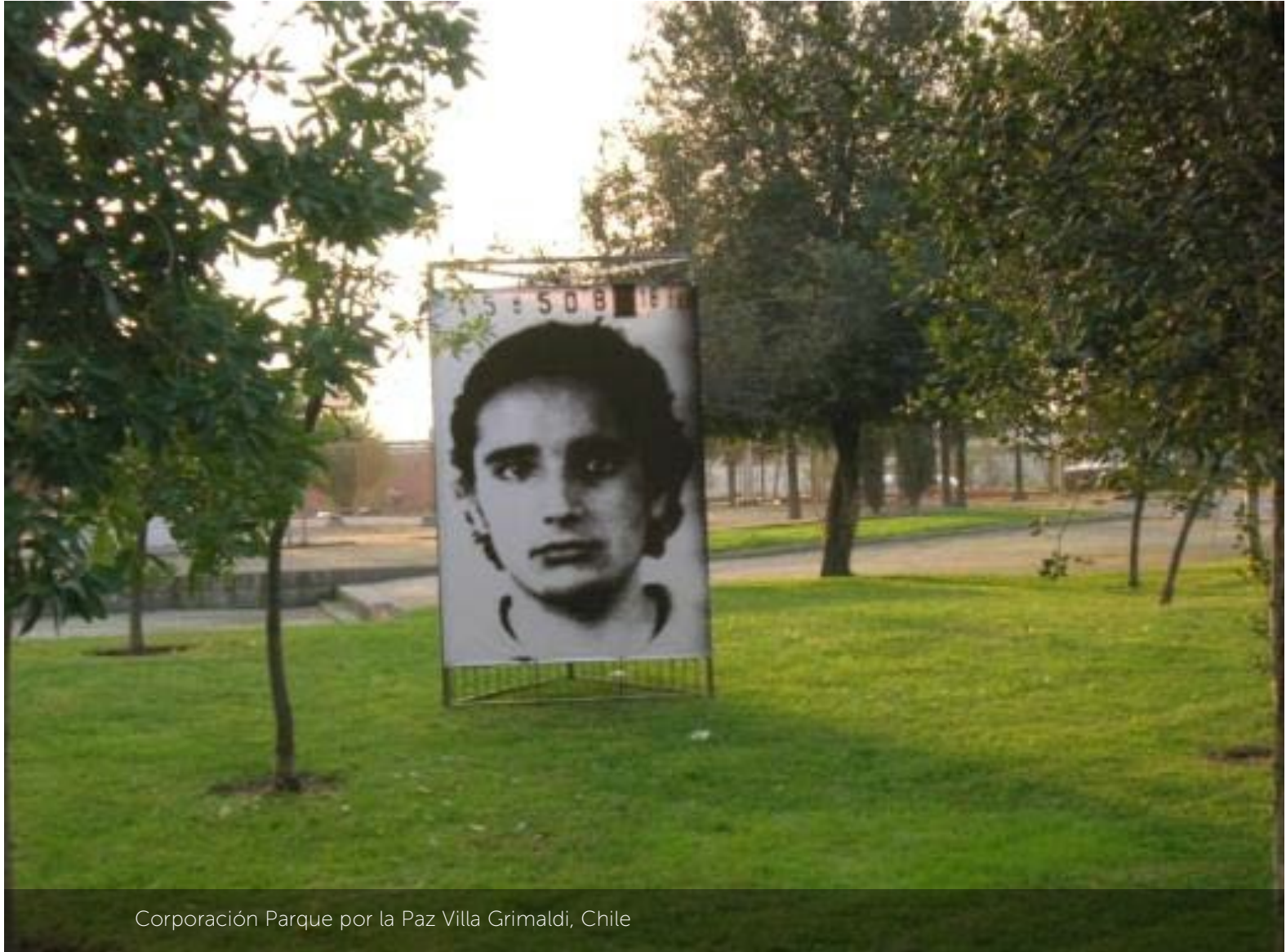
Corporación Parque por la Paz Villa Grimaldi, Chile

Increase and diversify funds to support, grow and sustain Coalition member and Secretariat activities.